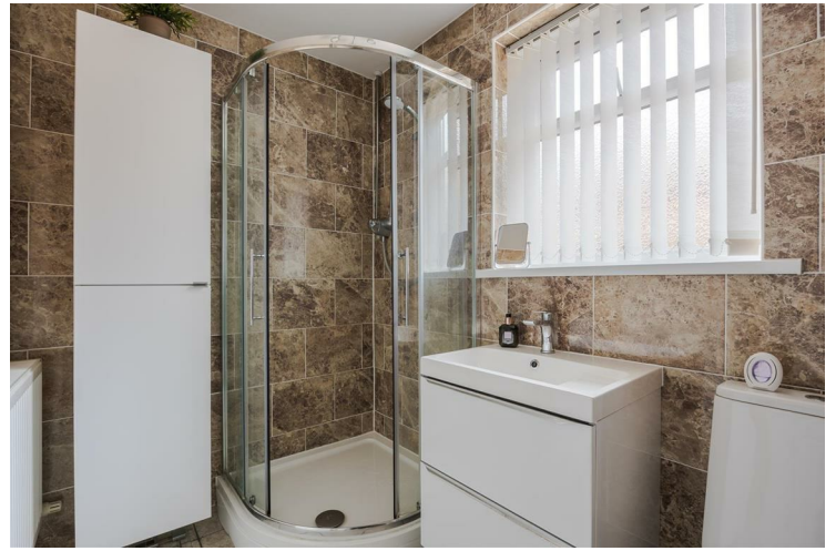
Shower room 6'9" x 6'2" (2.08m x 1.89m)