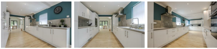
Kitchen 22'10" x 9'8" (6.96m x 2.95m)