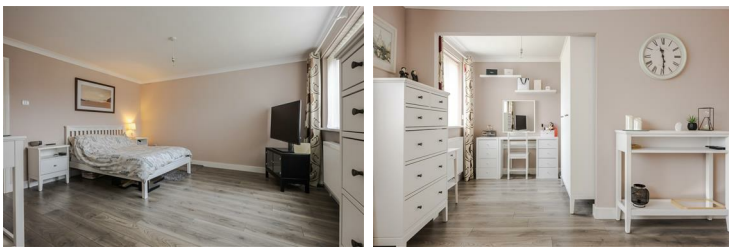
Bedroom One 19'10" x 14'4" (6.06m x 4.37m)