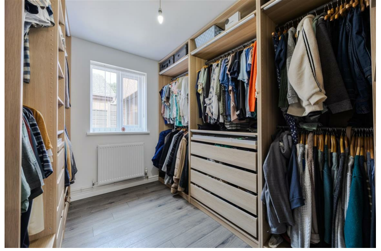
Bedroom Two 9'10" x 8'2" (3.01m x 2.51m)